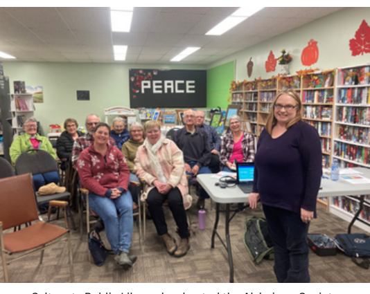
Saltcoats Public Library has hosted the Alzheimer Society for two public presentations about dementia and the branch has also introduced dementia friendly signage to help people with dementia better navigate their space

Since May 2021, the Alzheimer Society of Saskatchewan has been an active and supporting partner in the Dementia Supports in Rural Saskatchewan project in Yorkton, Melville, and the surrounding rural communities. Our central goal throughout the project, has been to reduce stigma and isolation that is experienced by people who are affected by dementia, by helping rural residents learn more about dementia and dementia friendly communities.