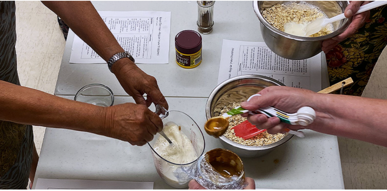
Photo courtesy of the UofS Cognitive Kitchen Project Spotlight on page 10-11